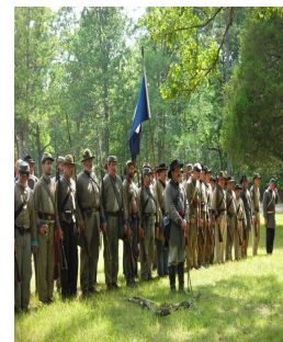
We need all affiliated companies to attend the drill and one of the school sessions

Attendance at our annual spring drills has decreased during the last several years. In an effort to increase the participation at the annual Spring Drill. We are changing the format of the annual Spring Drill. The format for Saturday will change to the following: The morning will be dedicated to company drill. The afternoon will focused on battalion evolutions and instruction. Classroom instruction will take place in the evening. The format for Sunday will not change.