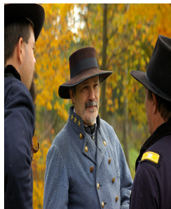
To the men of the Battalion - we need you to all recruit. The 150ths are right around the corner

“Please remember to bring 30 recruiting flyers to all battalion events.”