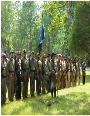
The Proud Men Of Medich Battalion

“Please remember to bring 30 recruiting flyers to all battalion events.”